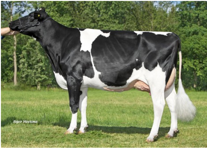
NRP Alisha RDC VG-89