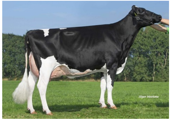
A-L-H Australia RDC VG-87

VG-89 Rubicon x VG-87 Supersire x VG-85 Alexander x EX-91 Goldwyn x EX-95 Durham x EX-93 Prelude x EX-94 Jubilant RF x EX-96 Marquis King x EX-90 Brutus x EX-90 Lucifer Lad