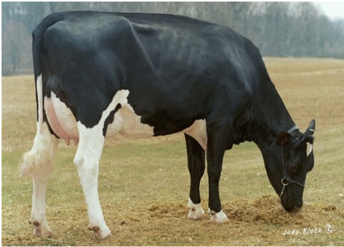
Brandt-View Miss-ET, Manfred x Pansy VG-87