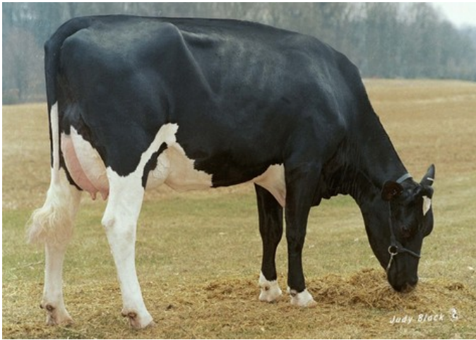
Brandt-View Miss-ET, Manfred x Pansy VG-87