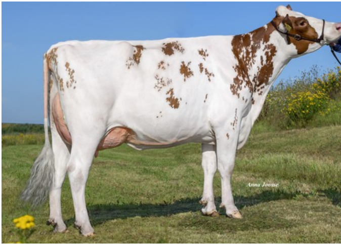
3STAR OH Red Rose VG-85