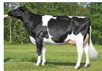
NRP Alisha RDC VG-89