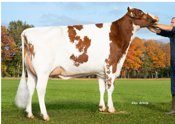
3STAR OH Alexia Red GP-84