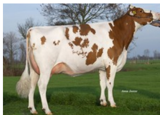
Batouwe Ailisha Salva Red VG-85