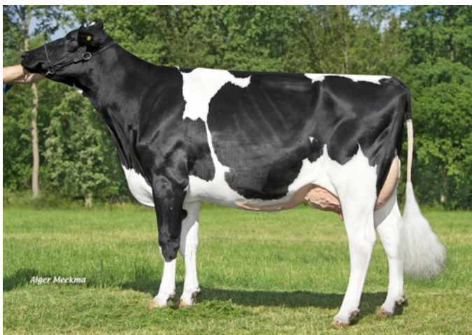
NRP Alisha RDC VG-89