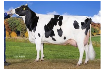
Delta Riant VG-87