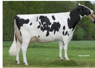
Delta Ralon EX-91