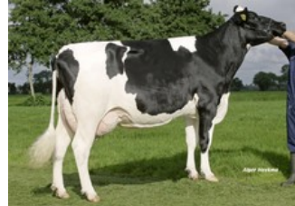
Etazon Renate VG-86