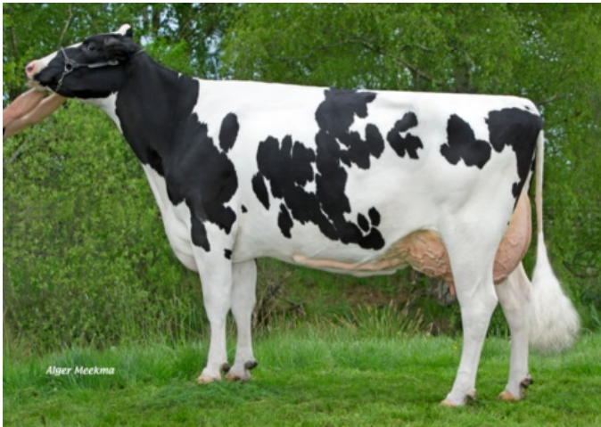
Delta Ralon EX-91