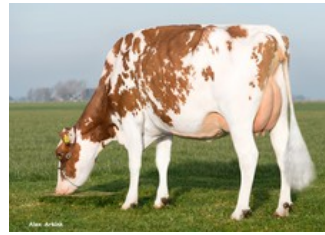
Batouwe Salsa Aiko Red VG-85