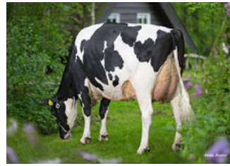
De Oosterhof Dg Rose RDC VG-89