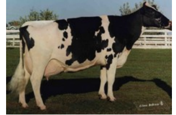
Golden-Oaks Mark Prudence EX-95

Tricky Red x Parfect x VG-87 Mark RDC x VG-86 Salvatore Rc x VG-89 Rubicon x GP-83 Aikman RDC x VG-85 Man-O-Man x VG-87 Mascol x VG-88 Durham x EX-90 Rudolph