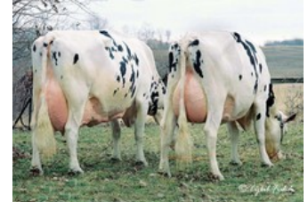
Gold-N-Oaks Duster Cindy en Gold-N-Oaks Morty Malibu EX-94

Tricky Red x VG-86 Ranger-Red x GP-84 Riveting x EX-91 Superhero x Silver x GP-82 Supersire x VG-87 Bookem x VG-88 Man-O-Man x VG-89 Shottle x EX-94 Morty Hoogste TPI roodfactor dragen binnen 3STAR