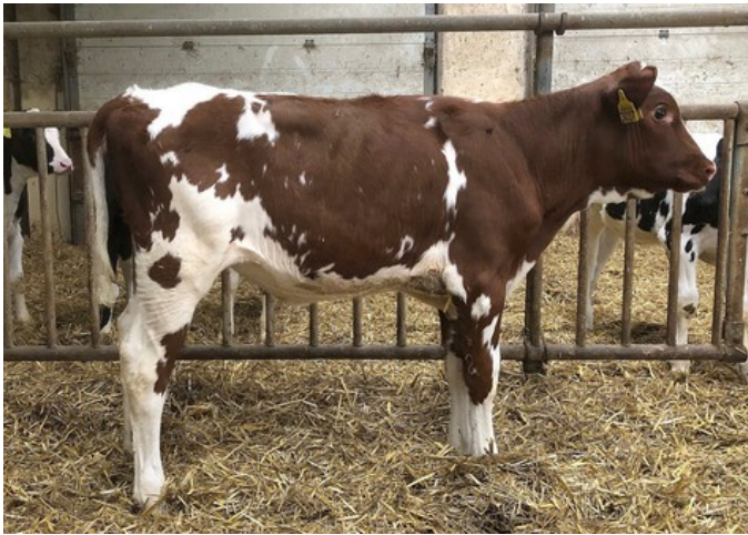
Koepon Tricky Range 294 Red