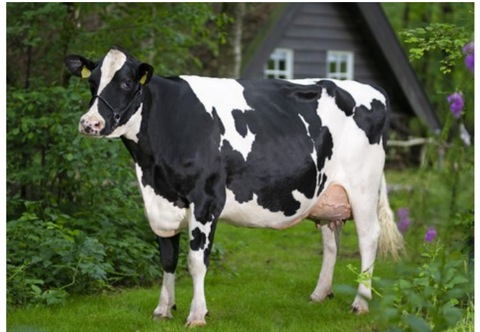
De Oosterhof Dg Rose RDC VG-89

Sheepster x Gameday x GP-84 AltaAltuve RDC x VG-86 Salvatore Rc x VG-89 Rubicon x GP-83 Aikman RDC x VG-85 Man-O-Man x VG-87 Mascol x VG-88 Durham x EX-90 Rudolph