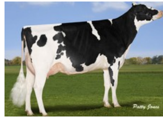
Cookiecutter Mom Hue VG-88