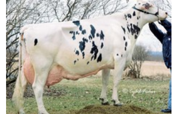
Gold-N-Oaks Duster Cindy VG-88

Tricky Red x Ranger-Red x GP-84 Riveting x EX-91 Superhero x Silver x GP-82 Supersire x VG-87 Bookem x VG-88 Man-O-Man x VG-89 Shottle x EX-94 Morty