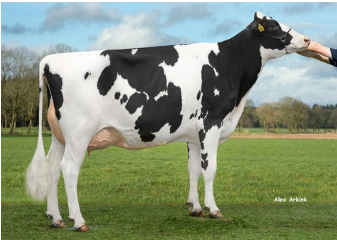
Tirs vad K&L Riveting Magnolia GP-84