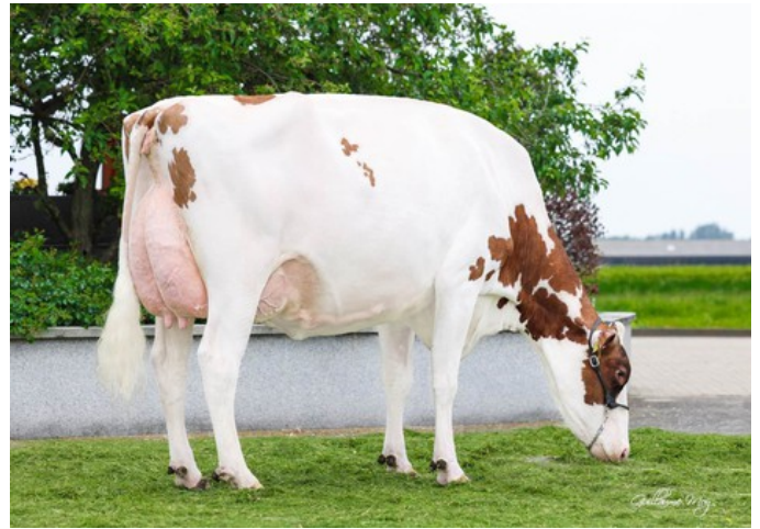
Ms Farnear Adler Arvis Argovia EX-91

Star Red x VG-87 Ronald RC x VG-85 Doppler RC x EX-91 Arvis*RC x EX-96 McCutchen x EX-92 Destry RDC x EX-96 Regiment x EX-95 Durham x EX-93 Prelude x EX-94 Jubilant RF