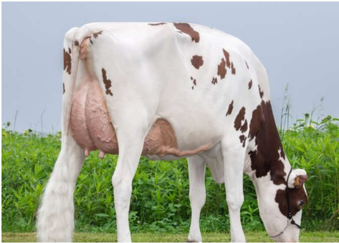
Wilt Aria Red VG-87