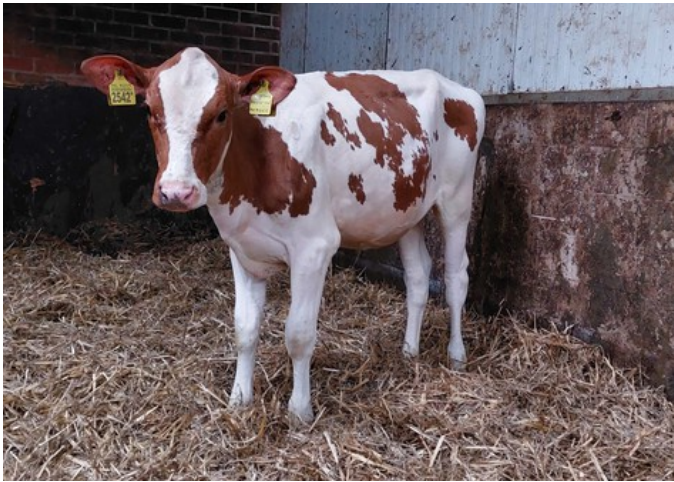
Poppe 3STAR Glennis P Red