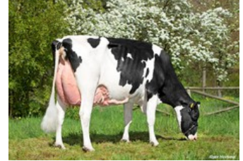
KHE I'm Good VG-88

Member PP Red x Star P RDC x Durable x VG-88 Gymnast x VG-88 Rubicon x VG-89 Shotgun x VG-88 Windbrook x VG-88 Jeeves x VG-85 Goldwyn x VG-85 Juror Ford