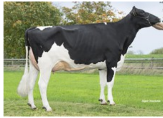
Poppe K&L Gorgina