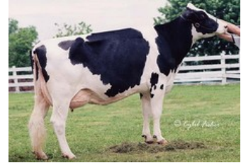
Mayerlane-DK Hiawatha EX-90

Dropbox x Parfect x VG-87 Mark RDC x VG-86 Salvatore Rc x VG-89 Rubicon x GP-83 Aikman RDC x VG-85 Man-O-Man x VG-87 Mascol x VG-88 Durham x EX-90 Rudolph