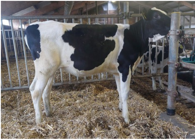
3STAR Amber 0364 P RDC