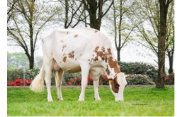
Amber PP Red VG-86

Sino P x Sinan PP x VG-86 Solitair P Red x VG-85 Abi Red PP x VG-87 Powerball-P x VG-86 Snow RF x VG-85 Observer x VG-88 Shottle x VG-87 O Man x VG-86 BW Marshall