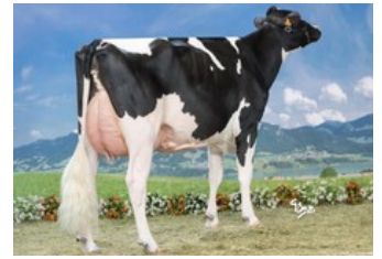
Flora Atwood Adeena VG-87