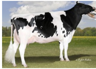
Sherona Hill Champion Angel VG-89