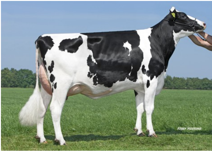
Delta Laure VG-86