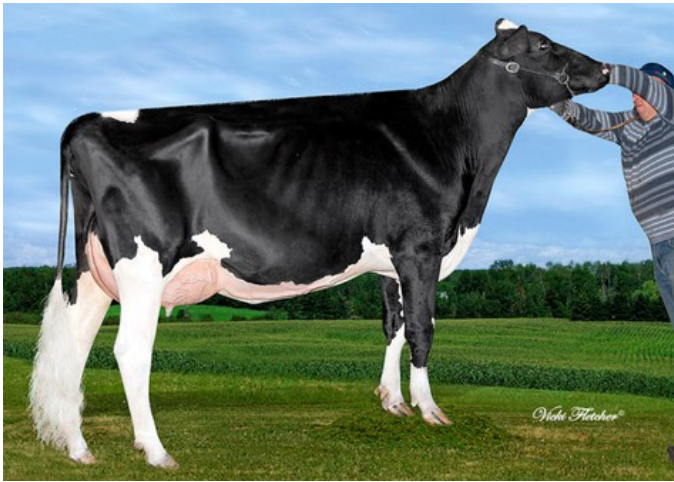
Misty Springs MOM Brenna RDC VG-86