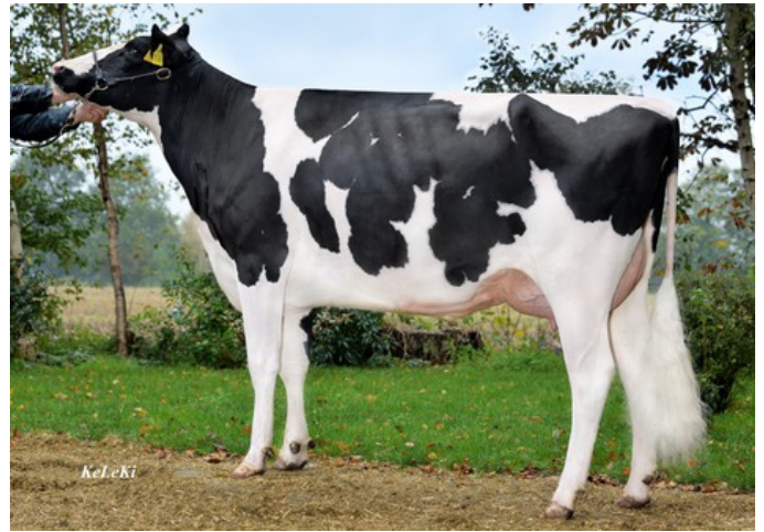
Brigitta PP RDC VG-87

Glamour x VG-86 Global x GP-83 Hotspot P x VG-87 Hologram-P x GP-83 Chipper-P x GP-84 Bookem x VG-86 Man-O-Man x VG-87 Mr Burns RC x VG-88 September Storm x VG-88 Talent