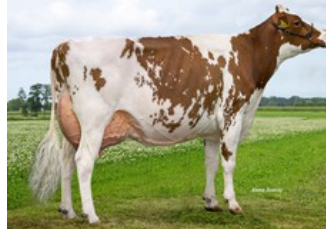
Visstein K&L SV Aderina Red VG-89