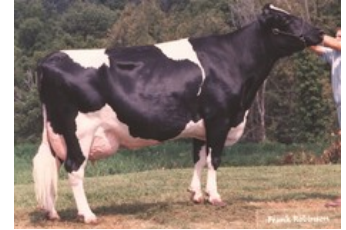
Jeta Commotion Cupid-ET VG-88

Rammstein Red x GP-84 AltaZazzle x Kenobi x Granite x VG-85 Rubicon x GP-84 Cashcoin x VG-86 Man-O-Man x VG-86 Shottle x GP-84 Finley x Brett