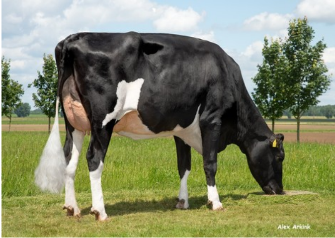
3STAR OH Mazzali GP-84