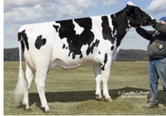
Gold-N-Oaks S Marbella VG-89