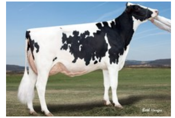
Gold-N-Oaks Arabell 1765 VG-88