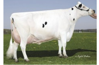
Gold-N-Oaks Morty Malibu EX-94

Serge Red x VG-85 Sputnik RDC x VG-89 Gywer RDC x VG-88 Pace-Red x VG-87 Penmanship x VG-88 MVP x GP-83 Epic x VG-88 Ramos x VG-89 Shottle x EX-94 Morty