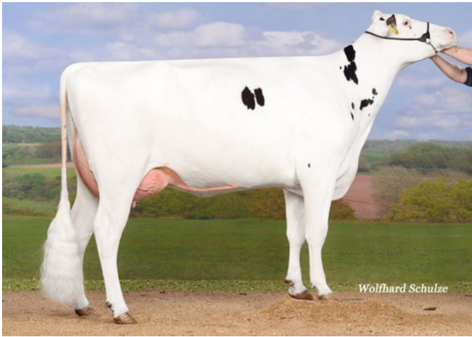
ZHW Atlantis RDC VG-89