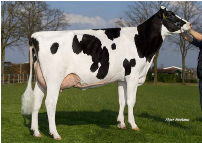
Diepenhoek Rozelle 56 VG-86