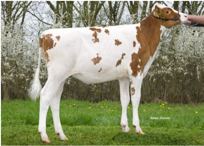
R&B Solitair Aisha P Red VG-86