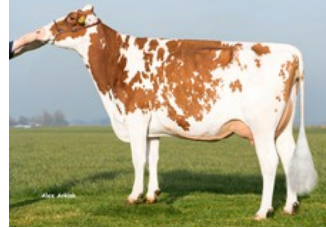
Batouwe Salsa Aiko Red VG-85