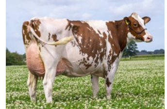
Visstein K&L SV Aderina Red VG-89

Ridercup x VG-86 Rubels-Red x VG-89 Salvatore Rc x VG-87 Nugget RDC x VG-85 Supersire x EX-90 Superstition x EX-91 Goldwyn x EX-95 Durham x EX-93 Prelude x EX-94 Jubilant RF