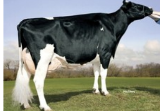
Kamps-Hollow Durham Altitude EX-95