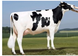
Sandy-Valley IO Amethyst VG-87