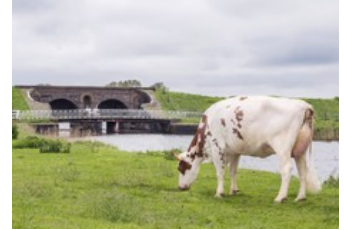
Lakeside Ups Red Range VG-86

Camden x VG-85 Rubels-Red x VG-86 Salvatore Rc x VG-89 Rubicon x GP-83 Aikman RDC x VG-85 Man-O-Man x VG-87 Mascol x VG-88 Durham x EX-90 Rudolph x EX-95 Chief Mark