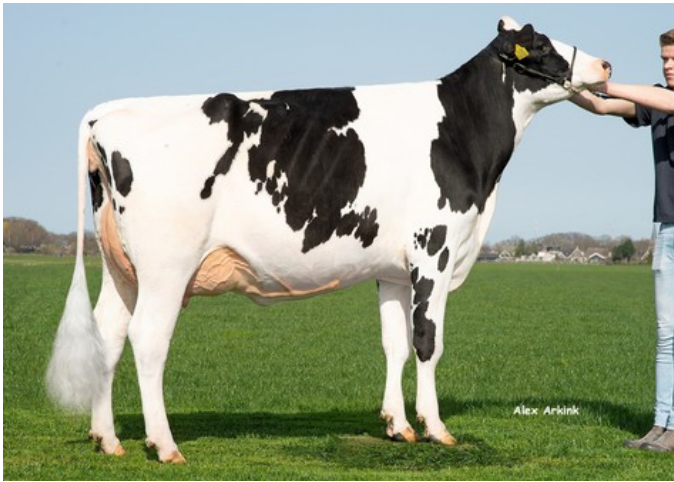
JK Eder Medley Evalyn 1 EX-90