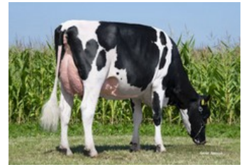
JK Eder Evalyn EX-91