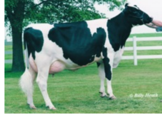
Ricecrest Luke Lauren EX-91