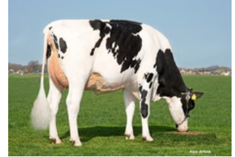
JK Eder Medley Evalyn 1 EX-90

Chandler x EX-90 Medley x EX-91 Jedi x VG-88 President x GP-84 Mogul x VG-86 Active x EX-90 Titanic x VG-85 Addison x VG-86 Manfred x EX-90 Duster