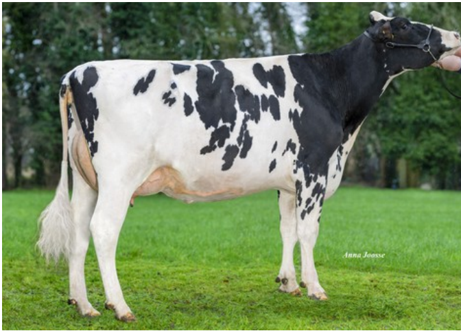
Batouwe WM Aimee RDC GP-83