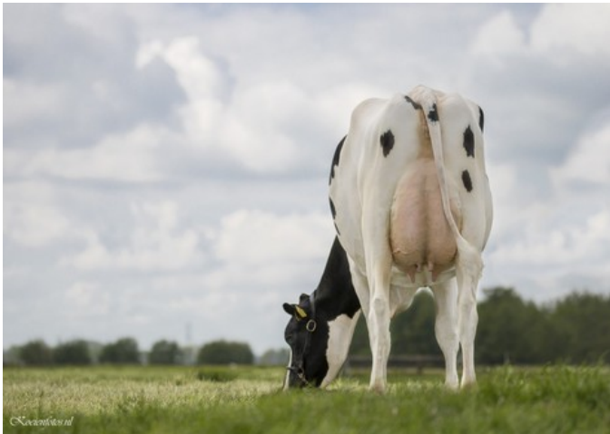
PR Shauny VG-88