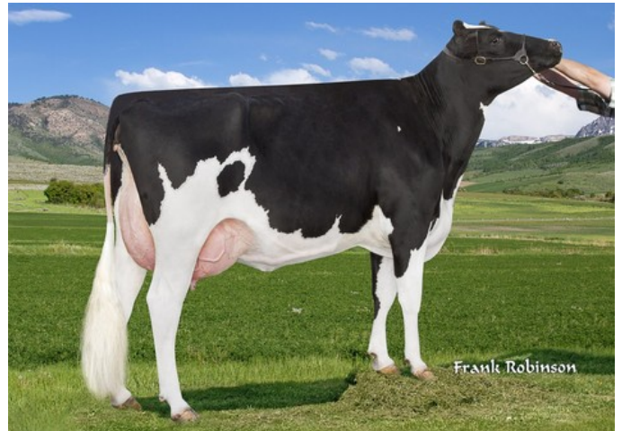
Seagull-Bay Shauna Saturn VG-87

VG-87 Tropic x Doc x VG-88 Modesty x GP-83 McCutchen x VG-87 Man-O-Man x EX-92 Planet x VG-86 Shottle x VG-86 O Man x EX-92 Rudolph x EX-90 Bell Elton