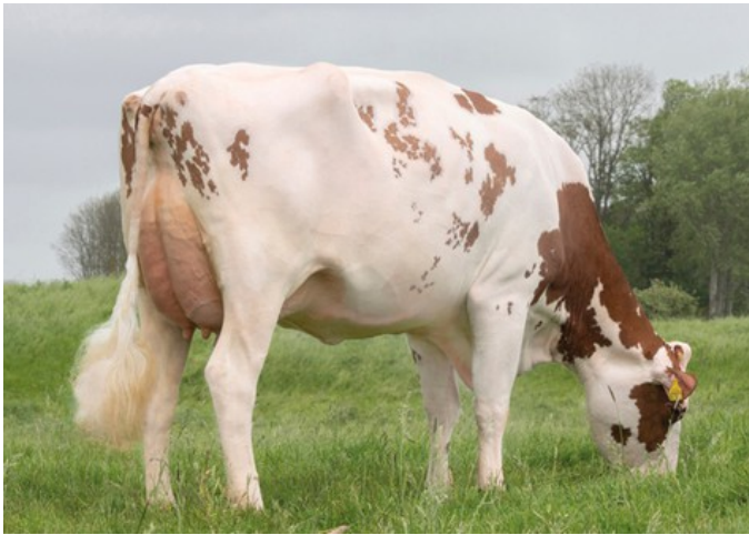
Lakeside Ups Red Range VG-86