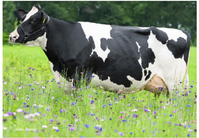
De Oosterhof Dg Rose RDC VG-89

VG-87 Gameday x GP-84 AltaAltuve RDC x VG-86 Salvatore Rc x VG-89 Rubicon x GP-83 Aikman RDC x VG-85 Man-O-Man x VG-87 Mascol x VG-88 Durham x EX-90 Rudolph x EX-95 Chief Mark