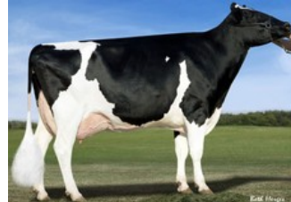
KHW Goldwyn Aiko RDC EX-91