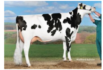
Teemar Observer Airline VG-85