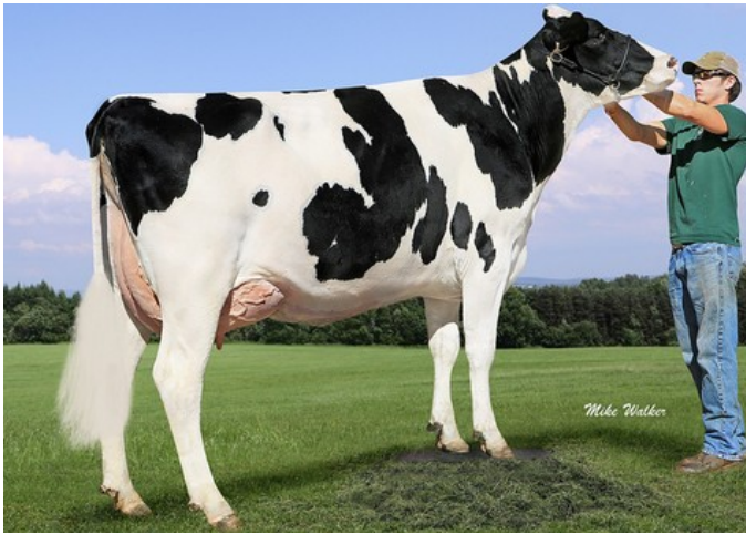
Farnear-TBR-BH Valour VG-88