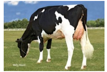
KY-Blue GW Dana EX-91