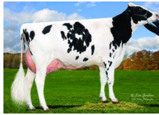
Farnear-TBR-BH Vickie EX-94 VG-87