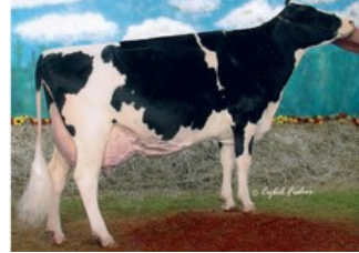
MS Kingstead Chief Adeen EX-94