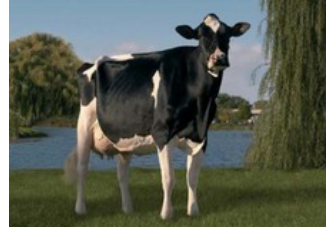
Scientific Debutante Rae EX-92