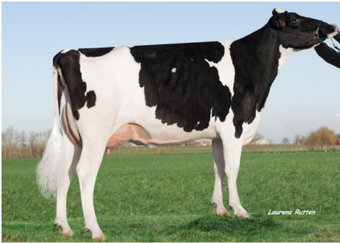
Kemelia V/H Zomerbloemhof VG-87