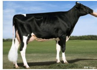
Co-Vista Atwood Desire EX-90