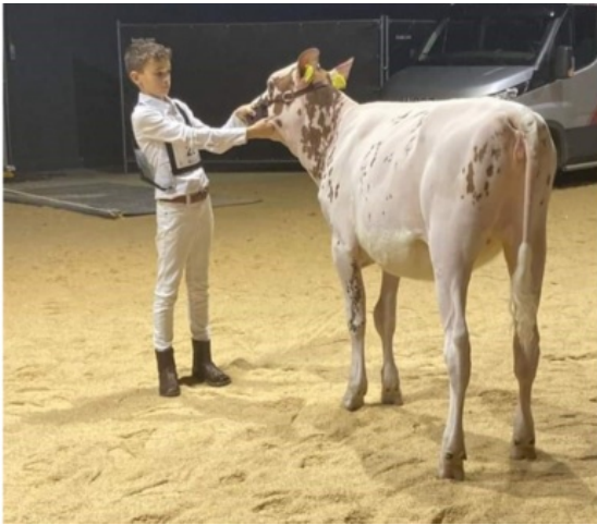
De Wijde Blik Roseanne Red 2