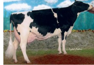
MS Kingstead Chief Adeen EX-94