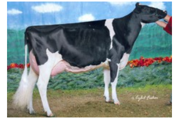
MD Delight Durham Atlee (2) EX-92