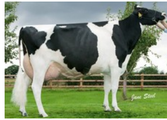
Ridgefield Gold Atlee VG-89