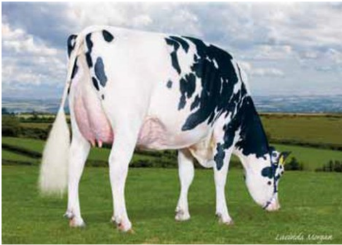
Willsbro Lambda Amber 195 GRZ VG-88