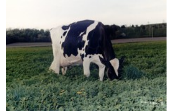
Golden-Oaks Mark Prudence EX-95

Star P RDC x VG-87 AltaAltuve RDC x VG-86 Salvatore Rc x VG-89 Rubicon x GP-83 Aikman RDC x VG-85 Man-O-Man x VG-87 Mascol x VG-88 Durham x EX-90 Rudolph x EX-95 Chief Mark