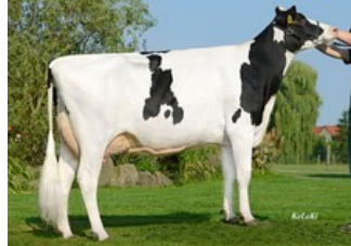
KHE India VG-88