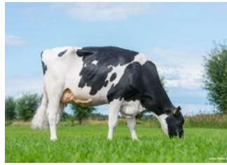
KHE I'm Good VG-88