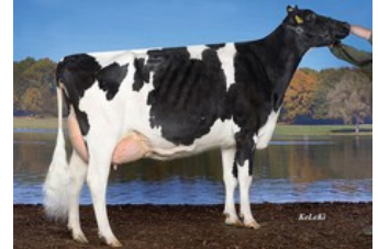
KHE Illinois VG-88

Star P RDC x Durable x VG-88 Gymnast x VG-87 Rubicon x VG-89 Shotglass x VG-88 Windbrook x VG-88 Jeeves x VG-85 Goldwyn x VG-85 Juror Ford x VG-85 Cleo