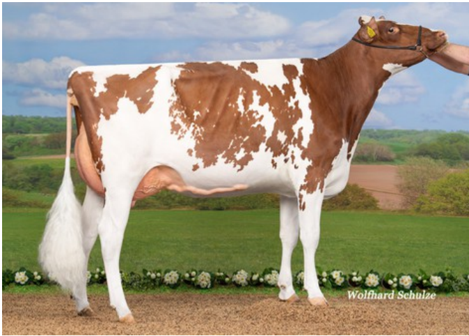
De Wildsheuvel Jessie-Red VG-86