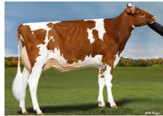
Golden-Oaks A Talent-Red EX-90