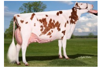
Ms Pottsdale Defiant Tang Red EX-94