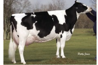
Ernest-Anthony SD Tobi EX-96

VG-86 Altitude-Red x EX-90 Avalanche*RC x EX-94 Defiant RDC x EX-92 Debonair Red x EX-91 Advent-Red x EX-93 Emerson x VG-87 Rudolph x EX-96 Stardust x EX-95 Inspiration x VG-85 Sheik