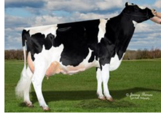
All-In-Tine Debonair Tart EX-92