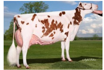
Ms Pottsdale Defiant Tang Red EX-94