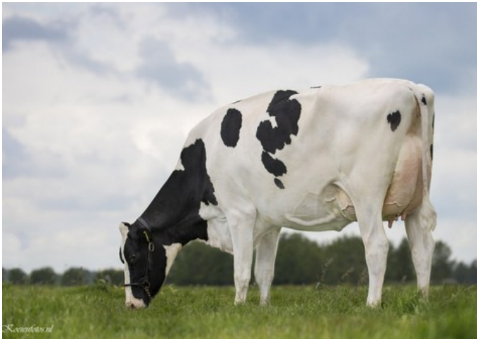
PR Shauny VG-88

VG-86 Tropic x VG-86 Doc x VG-88 Modesty x GP-83 McCutchen x VG-87 Man-O-Man x EX-92 Planet x VG-86 Shottle x VG-86 O Man x EX-92 Rudolph x EX-90 Bell Elton