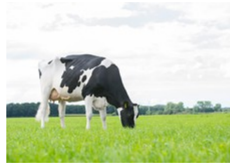
KHE I'm Good VG-88