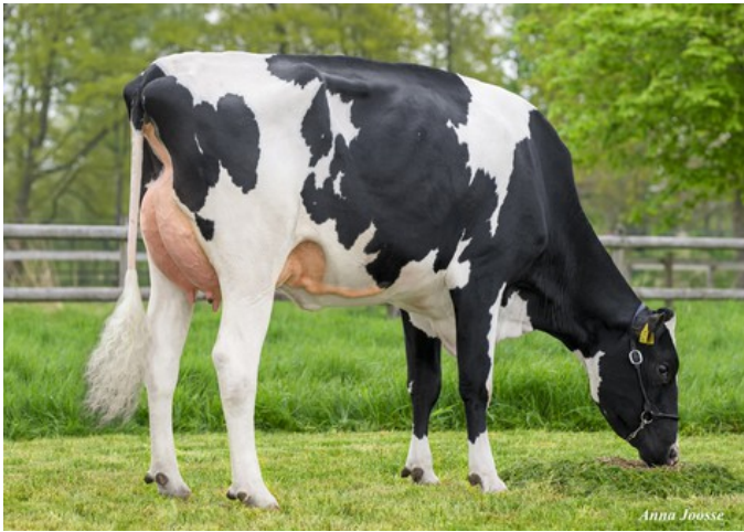
K&L Poppe Goody VG-86