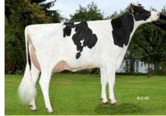
KHE Island VG-89