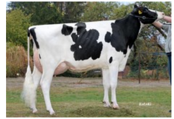
KHE Isolde VG-87