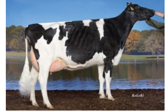
KHE Illinois VG-88

GP-83 Palmer x VG-86 Soundcloud x VG-88 Gymnast x VG-87 Rubicon x VG-89 Shotglass x VG-88 Windbrook x VG-88 Jeeves x VG-85 Goldwyn x VG-85 Juror Ford x VG-85 Cleo