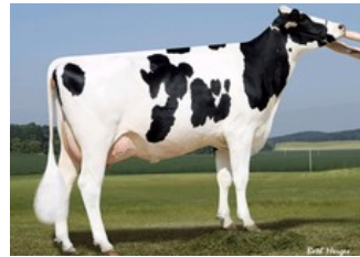
Sandy-Valley IO Amethyst VG-87