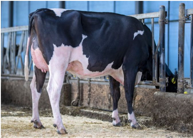
K&L OH Mistress VG-86