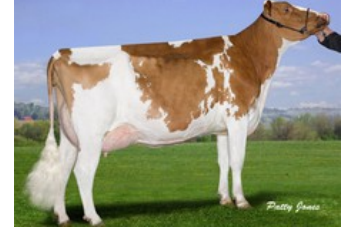
Misty Springs MB Brighter Red VG-87

Matty PRDC x GP-83 Hotspot P x VG-87 Hologram-P x GP-83 Chipper-P x GP-84 Bookem x VG-86 Man-O-Man x VG-87 Mr Burns RC x VG-88 September Storm x VG-88 Talent x VG-87 Dragon RDC