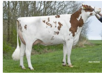
Lakeside Ups Red Range VG-86