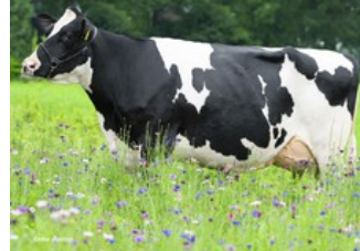
De Oosterhof Dg Rose RDC VG-89