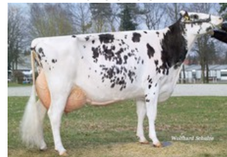
DT Spottie EX-93 (s. Derry), same

GP-84 Bellroy x VG-87 Imax x Missouri x G-79 Smurf x VG-86 Garrett x VG-87 Shottle x VG-87 Jocko x VG-87 Rudolph x VG-85 Grand x VG-87 Prelude