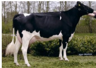
SH Jocko Jen VG-87