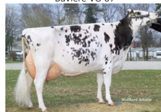
DT Spottie EX-93 (s. Derry), same

GP-84 Bellroy x VG-87 Imax x Missouri x G-79 Smurf x VG-86 Garrett x VG-87 Shottle x VG-87 Jocko x VG-87 Rudolph x VG-85 Grand x VG-87 Prelude